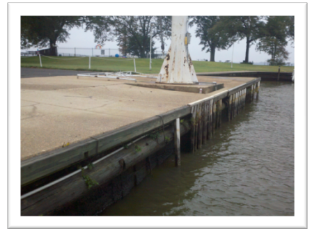
Settling apron by large hoist