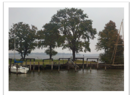
C-pier slips in harbor