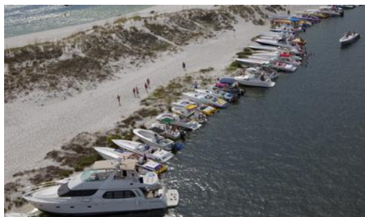
The Emerald Coast Poker Run boats is one of the most spectacular settings in the country.