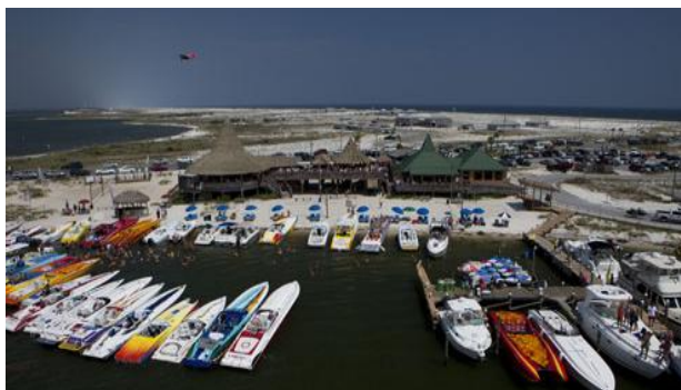
The scenery is a match for the hardware at the Emerald Coast Poker Run.