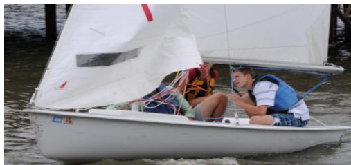
Conner sails out of slip